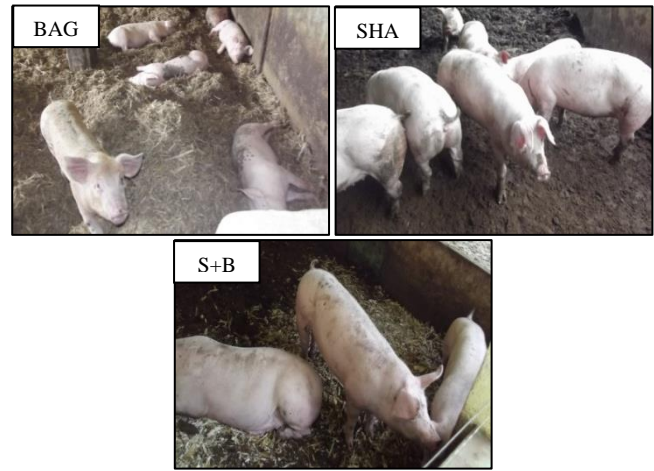
Figure 1 Three types of superimposed beds: i; sugarcane bagasse (BAG), ii; shavings (SHA), and iii; shavings+sugarcane bagasse (S+B).

We compared three types of superimposed beds: i: sugarcane bagasse (BAG), ii; shavings (SHA), and iii; shavings+sugarcane bagasse (S+B) at a ratio of 1:1. The pens had concrete floors underneath the beds and were equipped with a masonry feeder and two drinking fountains. (Fig. 1).